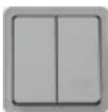
10AX 2G 2 way switch WXPPS22