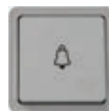
10A 1G bell push switch WXPPS12B