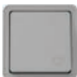
10AX 1G 2 way switch WXPPS12