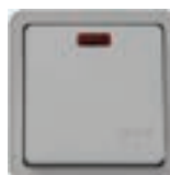
20AX 2P 1G 1 way switch with neon WXPDP84N