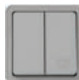
20AX 2P 2G 1 way switch WXPDP842