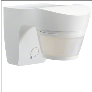
Motion detector infrared 200°, IP55, wall mounted, white