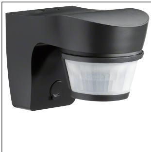
Motion detector infrared 200°, IP55, wall mounted, anthracite