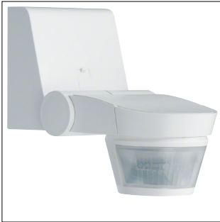
Motion detector comfort 140°, IP55, wall mounted, white