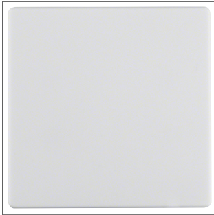
Rocker, Q.x, p. white velvety